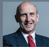
Rt Hon John Healey MP

The Landmark London, 222 Marylebone Road, London NW1 6JQ