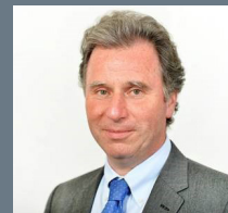
Rt Hon Sir Oliver Letwin MP